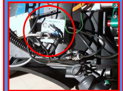
"Christmas Tree like"

Two separate 12 V output 11 poles Three additional RS output 3 poles